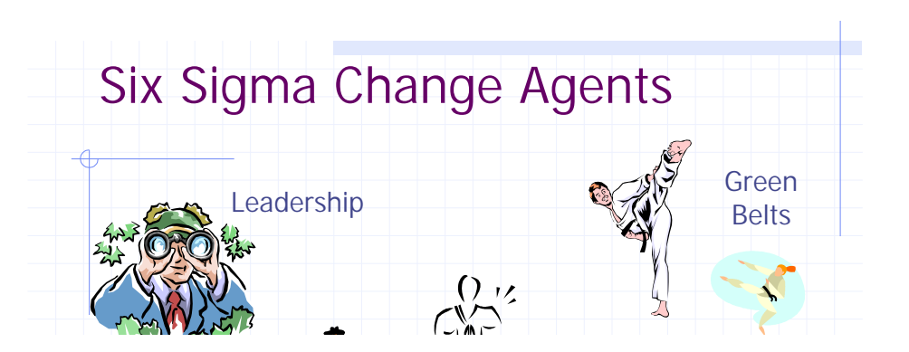
Figure 2: Six Sigma Infrastructure

A very powerful feature of Six Sigma is the creation of an infrastructure to assure that performance improvement activities have the necessary resources. In this author's opinion, failure to provide this infrastructure is the #1 reason why 80% of all TQM implementations failed in the past. Six Sigma makes improvement and change the full-time job of a small but critical percentage of the organization's personnel. These full time change agents are the catalyst that institutionalizes change. Figure 2 illustrates the required human resource commitment required by Six Sigma.